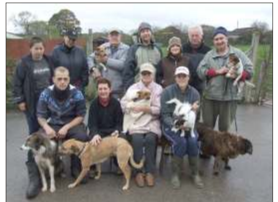
Members of Staff

We know you face rising costs too. All we ask is that you consider whether you can afford to make a donation to our Christmas Appeal, by filling in and returning the cut-off slip below. If you can't, we understand. If you can, our deepest gratitude.